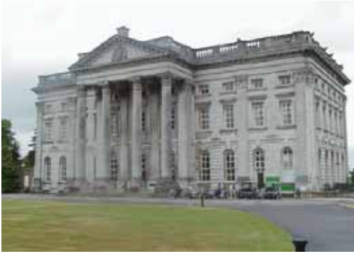
Moor Park Golf Club

“ We are looking forward to Whittle undertaking the exterior painting under our 10 year maintenance programme, which is a very cost-effective and efficient way of carrying out what is a hugely difficult task ”